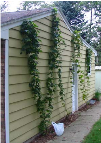
If the first year is a down year, what the heck are they going to look like next year!

I was warned when I got them, that they are a weed and will grow like