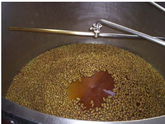
The multitude of wet hops donated by Racker and non-Racker members alike.

Thanks again to all who helped in this endeavor. It was a very big success and the best part of the whole thing is that this exact beer can never be reproduced again but we sure can try next year!